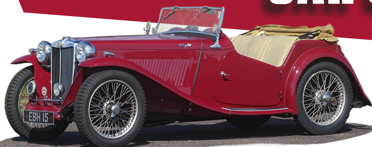
1931 MG TA